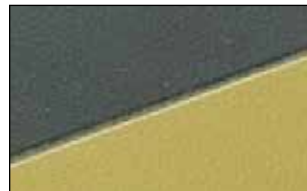
Kerasig (Black/Yellow Stripe)

Service Shop Delineation: R11 Service Reception Surface: R11