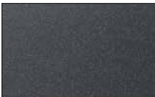
Anthracite Fully Vitrified

Sizes: 4x8" Service Shop and Service Reception Surface: R11 Thickness: 5/8" Optional matching cove base