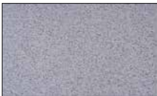
Light Grey Vitrified